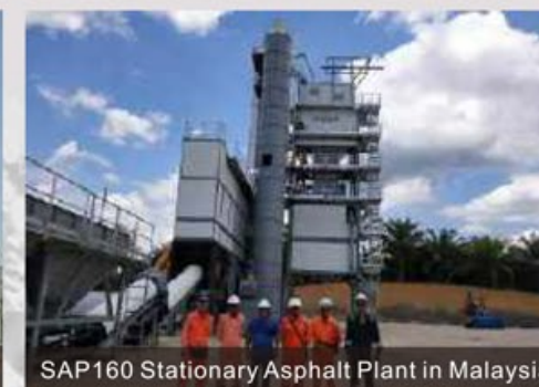
SAP160 Stationary Asphalt Plant in Malaysia