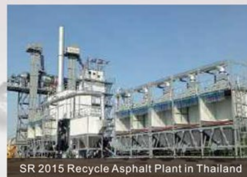
SR 2015 Recycle Asphalt Plant in Thailand