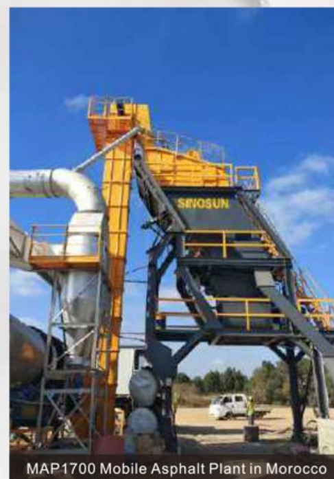
MAP1700 Mobile Asphalt Plant in Morocco