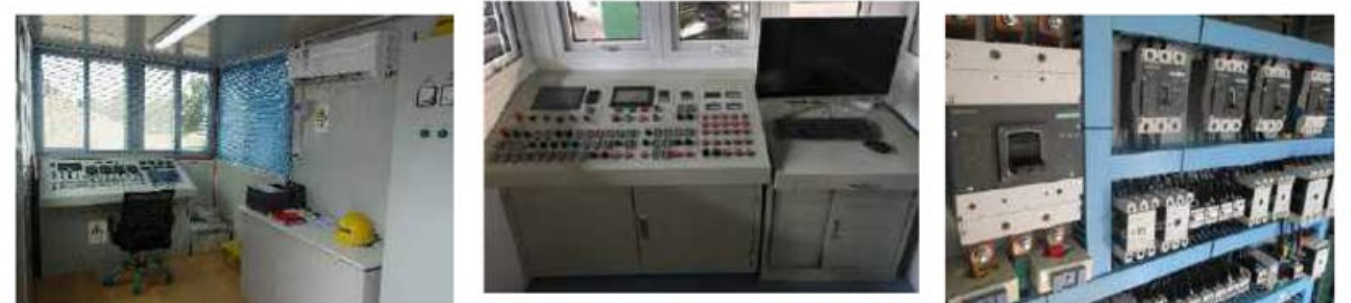
西门子PLC控制系统/ wifi远程监控系统 SIEMENS PLC control system / Remoting control with wifi