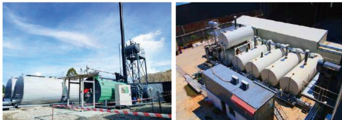
电加热式沥青罐 Electrical Heating Bitumen Tank