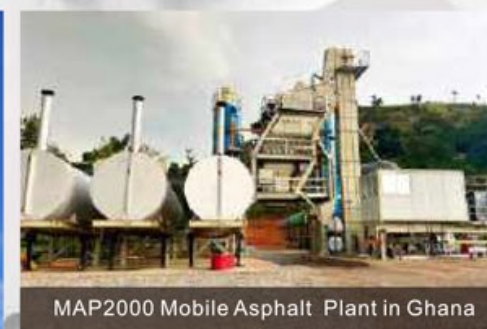
MAP2000 Mobile Asphalt Plant in Ghana