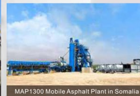
MAP1300 Mobile Asphalt Plant in Somalia