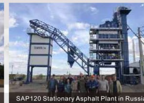
SAP120 Stationary Asphalt Plant in Russia