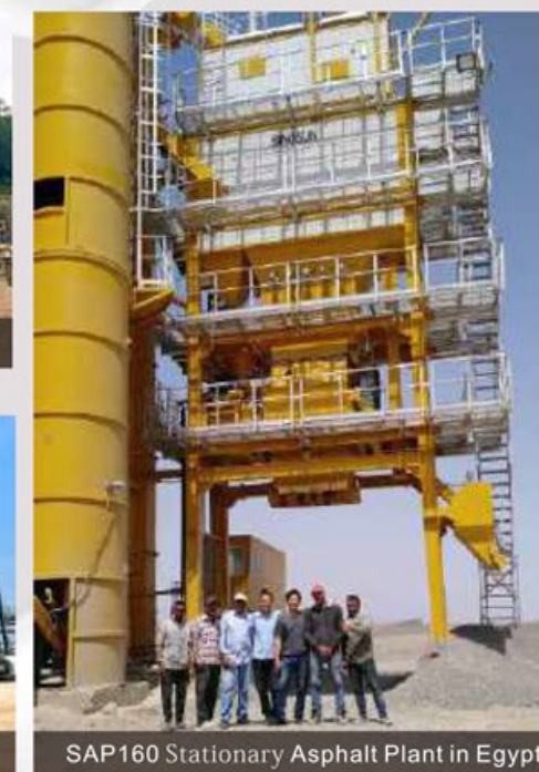
SAP160 Stationary Asphalt Plant in Egypt