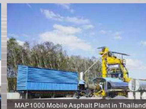
MAP1000 Mobile Asphalt Plant in Thailand