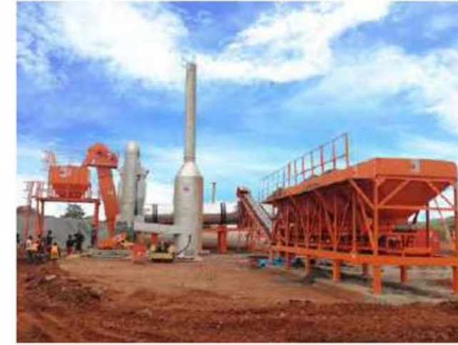
CAP Series Stationary Drum Mix Asphalt Plant