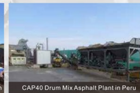
CAP40 Drum Mix Asphalt Plant in Peru