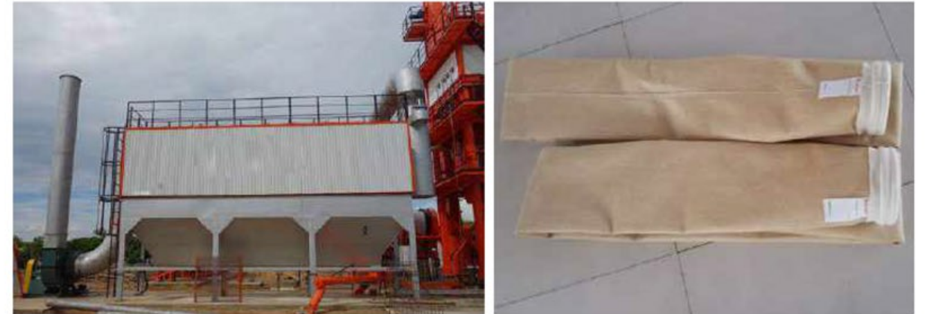
美国杜邦诺梅克斯除尘布袋/ 耐高温 USA DuPont Nomex brand filter bags/ High temperature Resistance