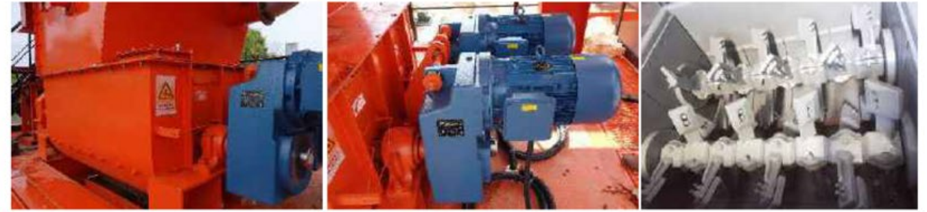
意大利MARINI技术/ 电机直连/ 铬钼锰合金钢耐磨材料 Italy MARINI design / Direct connection / Chromium manganese alloy steel