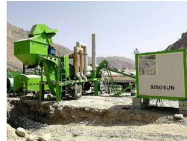
CAP-M Series Mobile Drum Mix Asphalt Plant