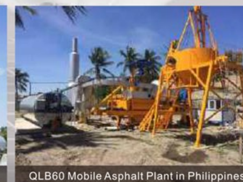
QLB60 Mobile Asphalt Plant in Philippines