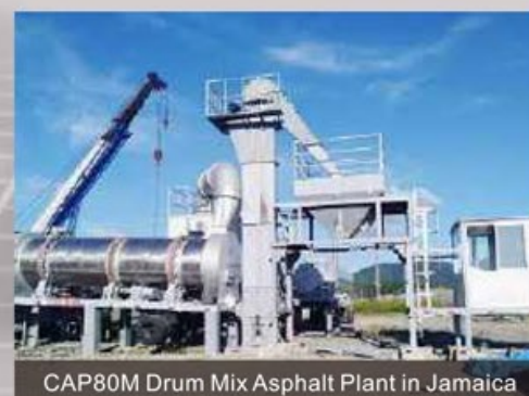
CAP80M Drum Mix Asphalt Plant in Jamaica