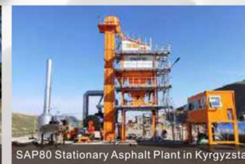
SAP80 Stationary Asphalt Plant in Kyrgyzstan