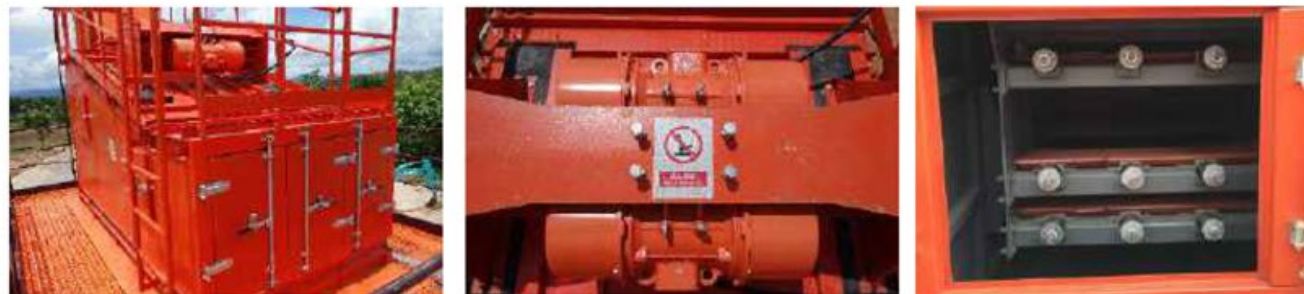
意大利OLI品牌/ 双电机直线型/ 高耐磨筛网 Italy OLI brand / Double vibrator linear type/ High wear resistance mesh screen