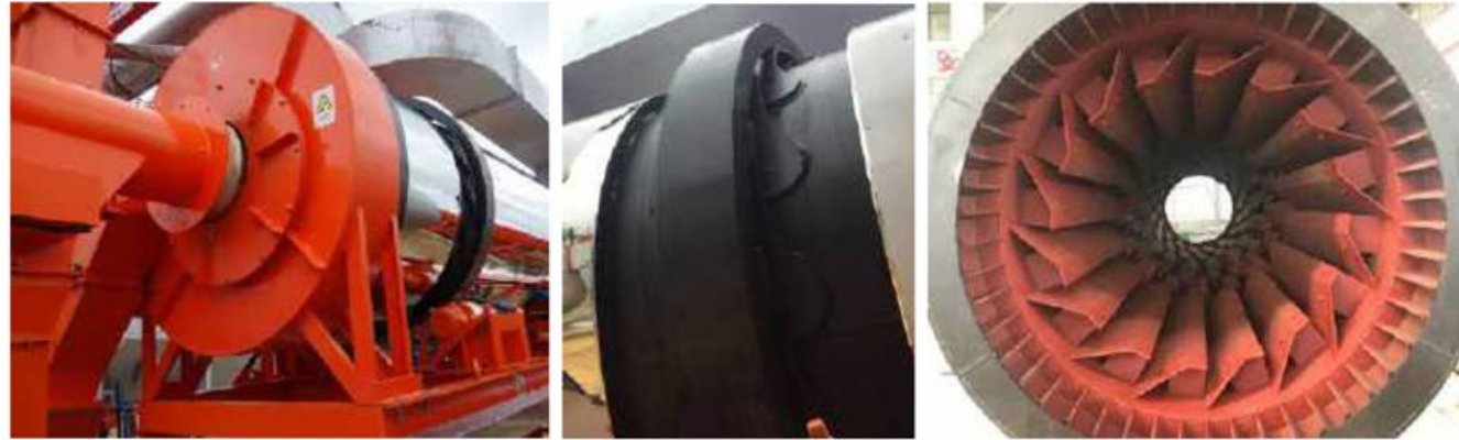
美国ASTEC设计弹性板/ 内部刮板采用日本Nikko设计/ 电机硬齿面直连 USA ASTEC Design Elastic Plate/ Inner blades adopt Japan Nikko Design/ Motor direct connection