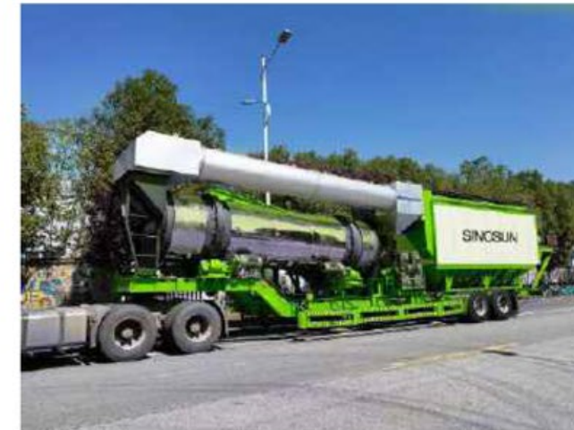
CAP-T Series Trailer type Mobile Drum Mix Asphalt Plant