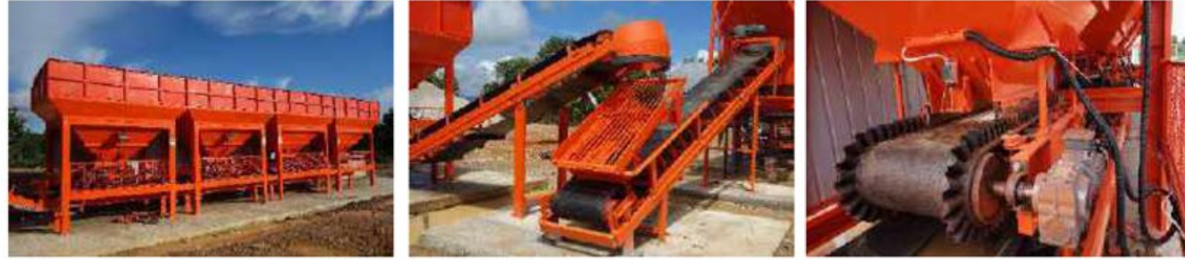
裙边带/ 缺料报警装置/ 电机减速机直连设计 Side wall type belt conveyor / Alarm sensor / Direct connection