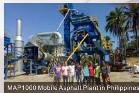
MAP1000 Mobile Asphalt Plant in Philippines